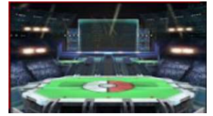
Pokémon Stadium 2