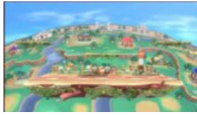
Town & City